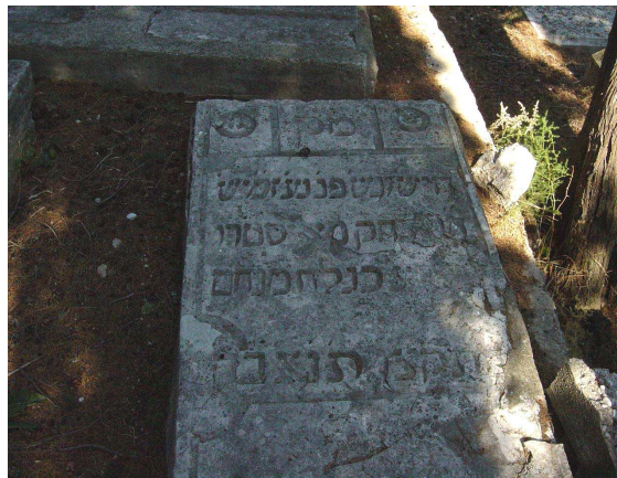
Ancient Headstone in Dubrovnik